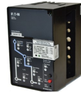
Digitrip RMS Trip Unit Upgrades