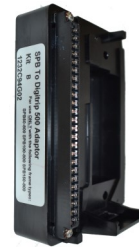
Plug-in Trip Unit Adapters